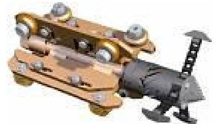
enz Chain Scraper

We would like to thank the Town of Tonawanda for making their facility and equipment available for this meeting.